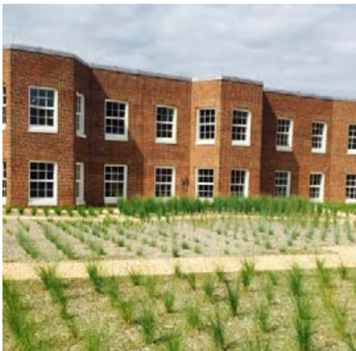
Above is a picture of the Caesar Rodney green roof.

The new Caesar Rodney complex on Academy Street has an intensive green roof over the dining hall. This green roof manages stormwater, helps with building climate control, and looks magnificent!