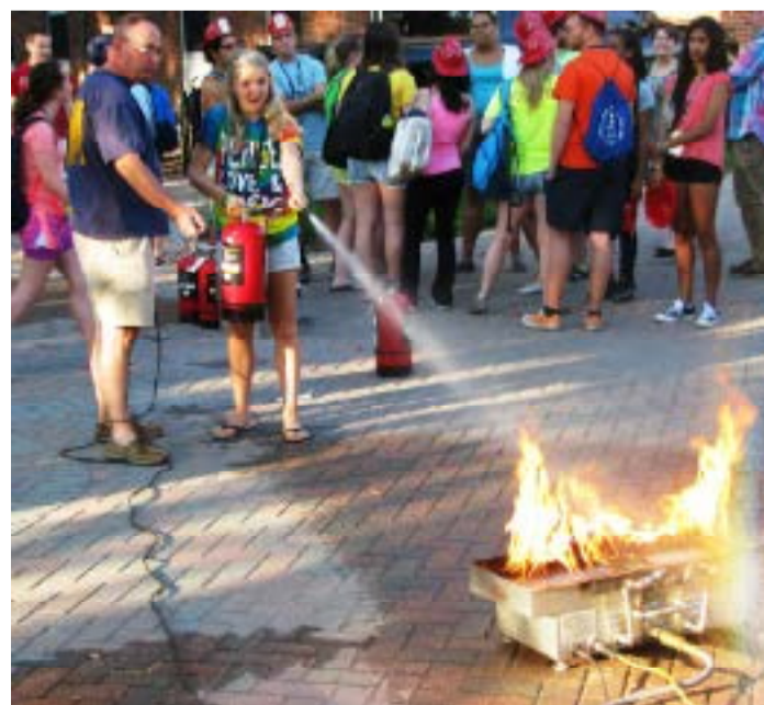
A Resident Assistant learn how to use a fire extinguisher.