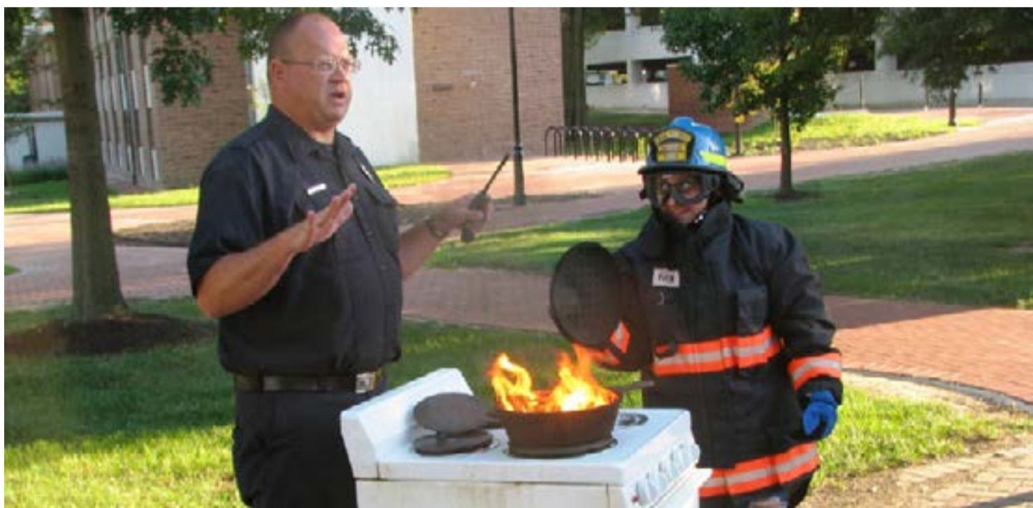
Resident Assistants were taught how to put out stovetop kitchen fires.

Campus Fire Safety Month has been recognized each September since 2005, as a method to raise the level of fire safety awareness to students and parents. Most on-campus residential fires occur during the month of September, making September the logical choice for Campus Fire Safety Month.