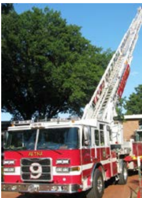
Aetna Station 9 Tiller